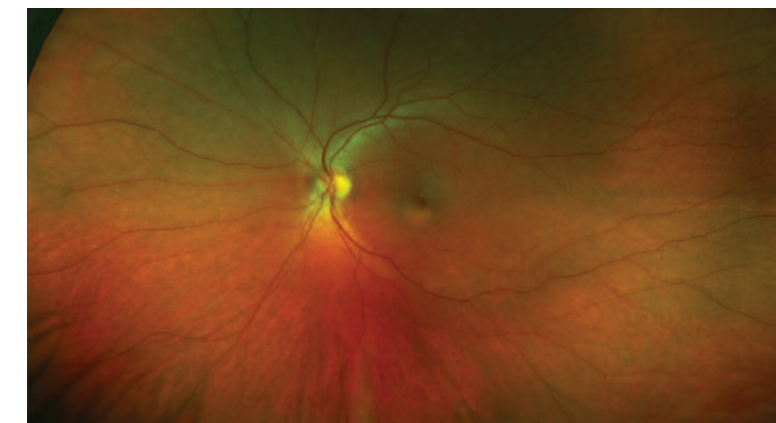
optomap ultra-wide digital retinal image of a healthy eye